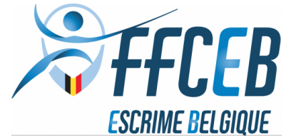
Image / TV rights

Participants may be photographed or filmed during the event. These photos or videos may be used to promote the organising club's or the FFCEB's activities (posters, leaflets, web, social networks, etc.).